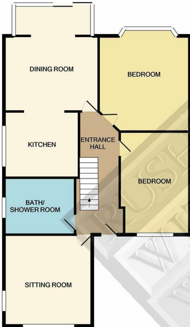
GROUND FLOOR APPROX. FLOOR AREA 856 SQ.FT. (79.5 SQ.M.)