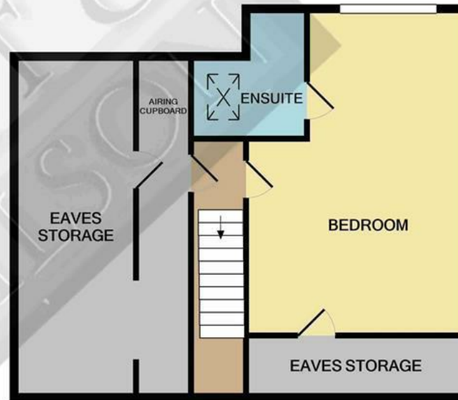
1ST FLOOR APPROX. FLOOR AREA 499 SQ.FT. (46.3 SQ.M.)

TOTAL APPROX. FLOOR AREA 1355 SQ.FT. (125.8 SQ.M.)